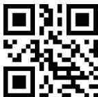
* Lighting when Read